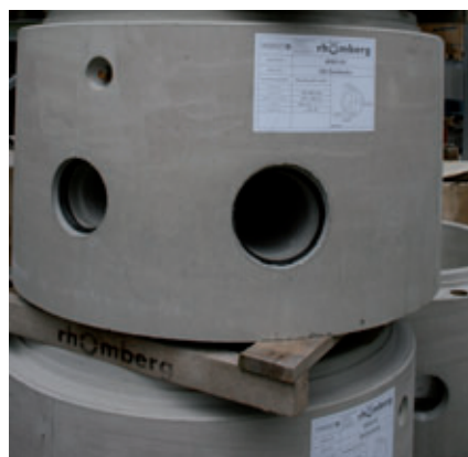
Regardless of the wall thicknesses of the manhole subcomponent, transport anchors are laterally encased into the wall or in the contact area for manhole rings.