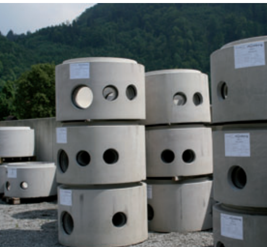
Numerous projects are accomplished with custom-made manhole subcomponents approximately two months after commissioning the Perfect manufacturing system.

Over the past few years, pre-assembled component manufacturers have had to make decisions of strategic significance to further the development of their companies. Most notably is the introduction of custom-made manhole bases for civil engineering in most European countries. Such is the case at the Rhomberg concrete plant, a family enterprise founded in 1964 in Dornbirn in Vorarlberg, Austria. The company specializes in manufacturing manhole components and has, for decades, very successfully supplied their domestic market, renowned for its high quality benchmarks. In addition to the strict concrete quality requirements, in general, and the high surface quality, in particular, it is predominantly the agricultural and infrastructure-related features in Vorarlberg that poses ever new challenges for the manufacturing of pre-assembled components.