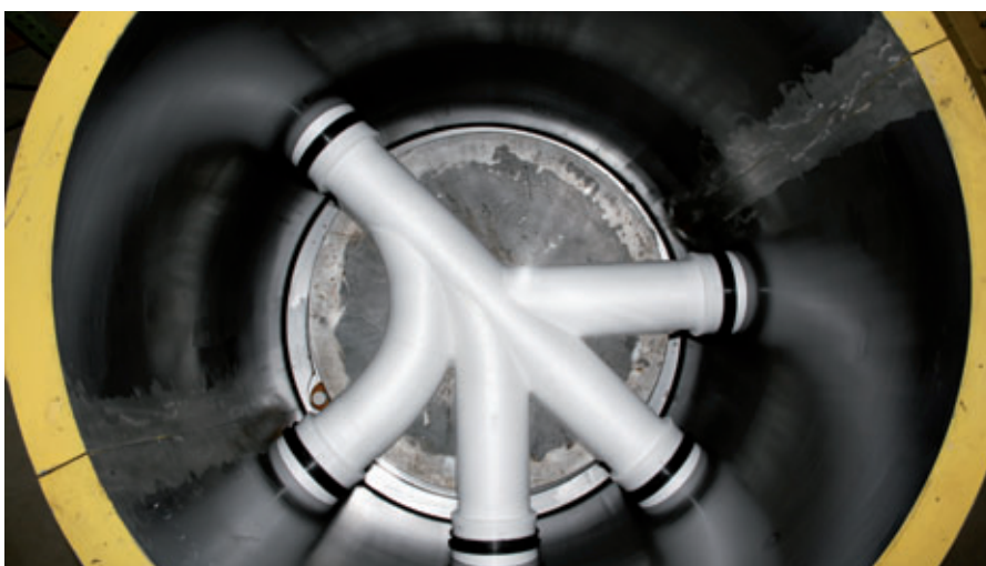
Several intakes are also combined in manhole bases < DN1000. – This picture shows a prepared mould for a DN 800 manhole subcomponent.

pipe connections. Furthermore, the quality requirements for new construction projects continue to remain high. "Both in public channel construction and in private domestic connections, customers have now realized that higher quality quickly pays off by producing a manhole in a single-step process, for example," said Mr. Rhomberg. "Meanwhile, private structures also need to be produced, for which the usual leak tests exist for the municipal sector."