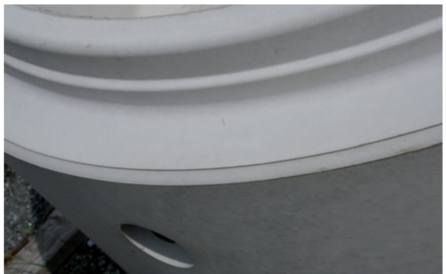
Visible product quality – the pre-assembled components manufactured with ready-mixed concrete from the Rhomberg concrete plant are convincing due to their flawless surface.

existing structures in particular, the market demands great precision of manhole configurations with regards to the disparity in channel connections and gradients and