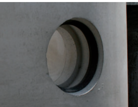
Firmly integrated seals into the concrete ensure tight connections of all common types of pipe.