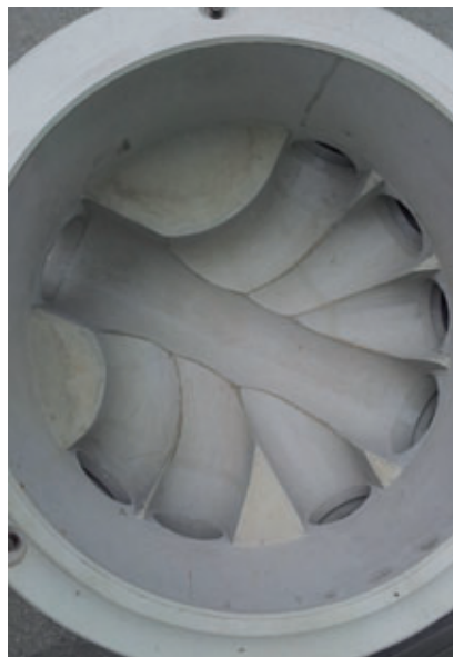
A multitude of pipe connections is characteristic of channel construction in Vorarlberg, as is seen in this component for the local sewer system in Dornbirn.