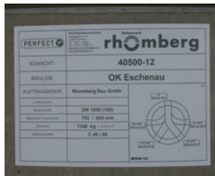
Diverse channel configurations are required for the extension of local sewers in Eschenau in Dornbirn.