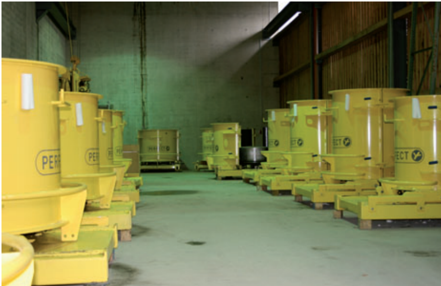
In total, 16 moulds are available for filling with self-compacting concrete in the start phase at the Rhomberg concrete plant.